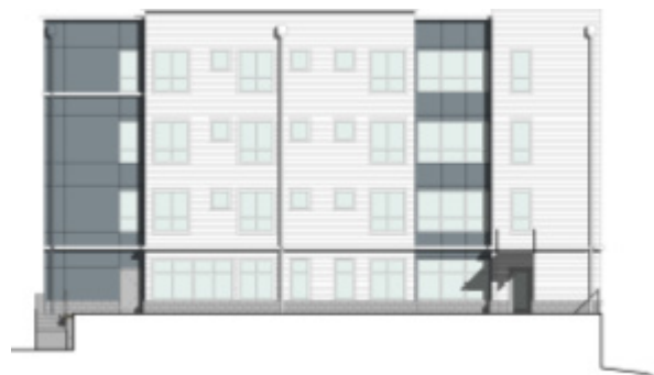
Back of 22 North