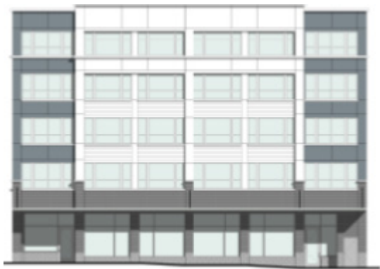
Front of 22 North- State Street

Supportive Housing for Young People Experiencing Homelessness